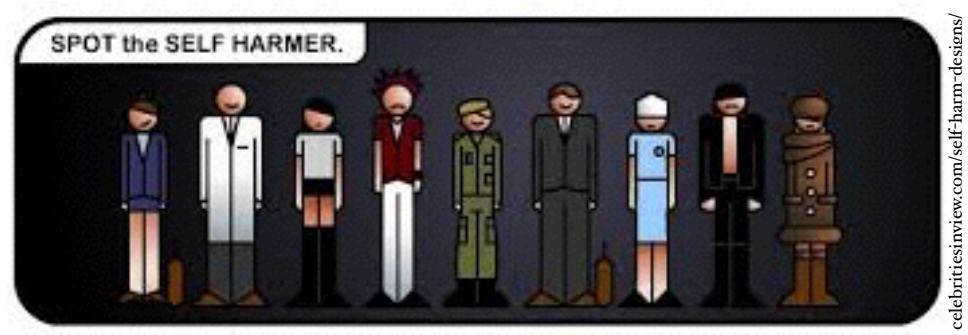
You may be surprised.

It is most typical that NSSI first begins between 12 years<sup>13</sup> of age and 16 years<sup>2</sup> of age, however, for